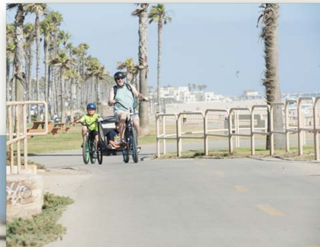
Coastal Trail Huntington Beach