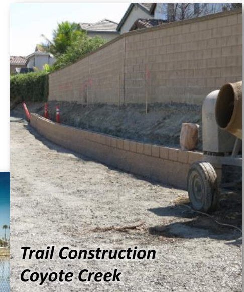
Trail Construction Coyote Creek