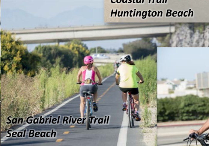
San Gabriel River Trail Seal Beach