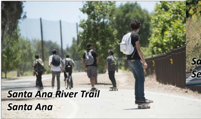
Santa Ana River Trail Santa Ana