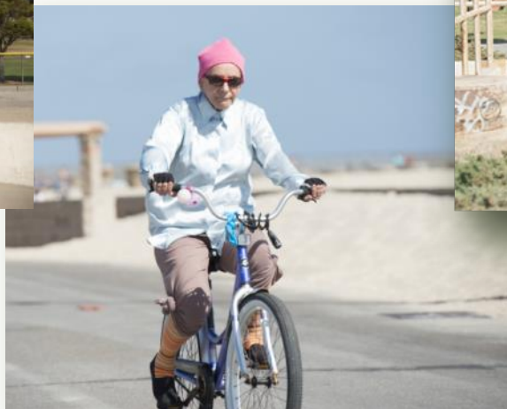
Coastal Trail Huntington Beach