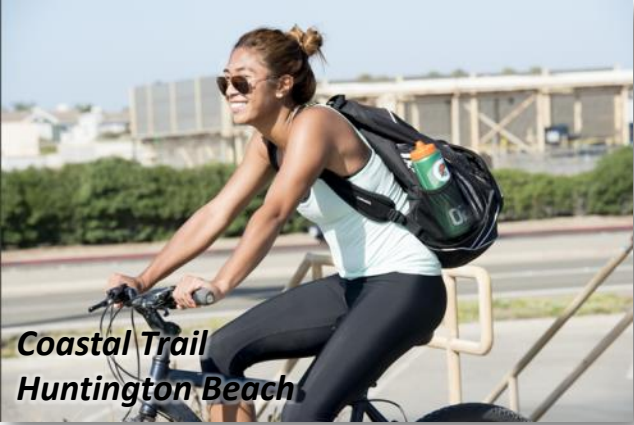
Coastal Trail Huntington Beach