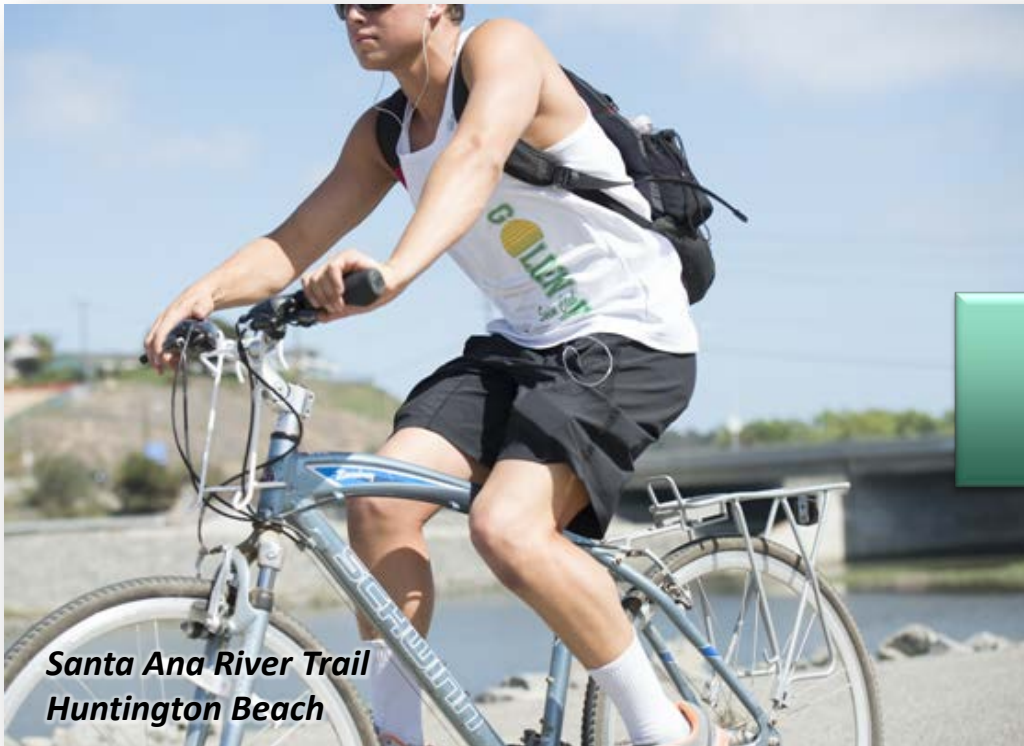
Santa Ana River Trail Huntington Beach

"I commute by bike and don't worry about freeway traffic or parking." - OC Loop Rider