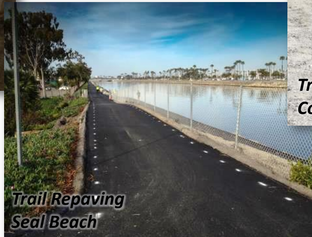
Trail Repaving Seal Beach