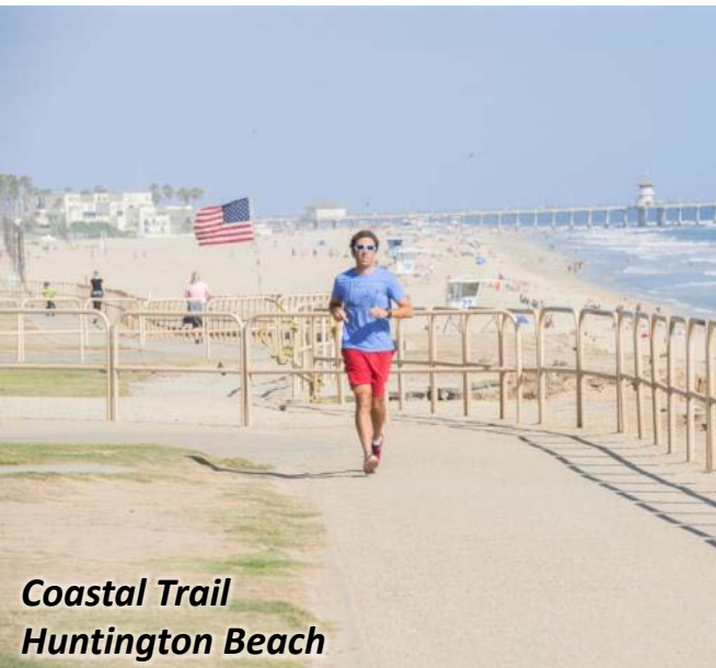
Coastal Trail Huntington Beach