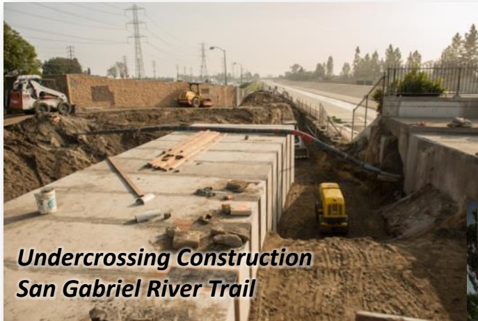
Undercrossing Construction San Gabriel River Trail