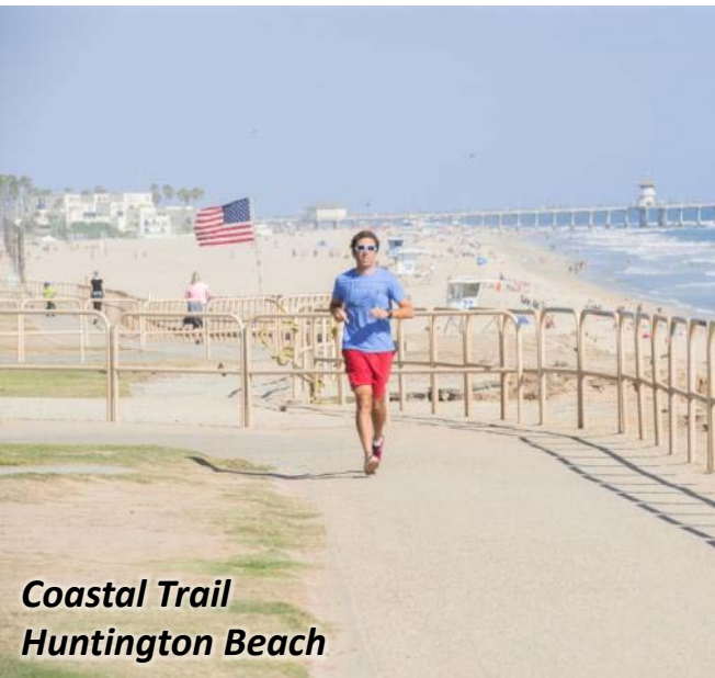
Coastal Trail Huntington Beach