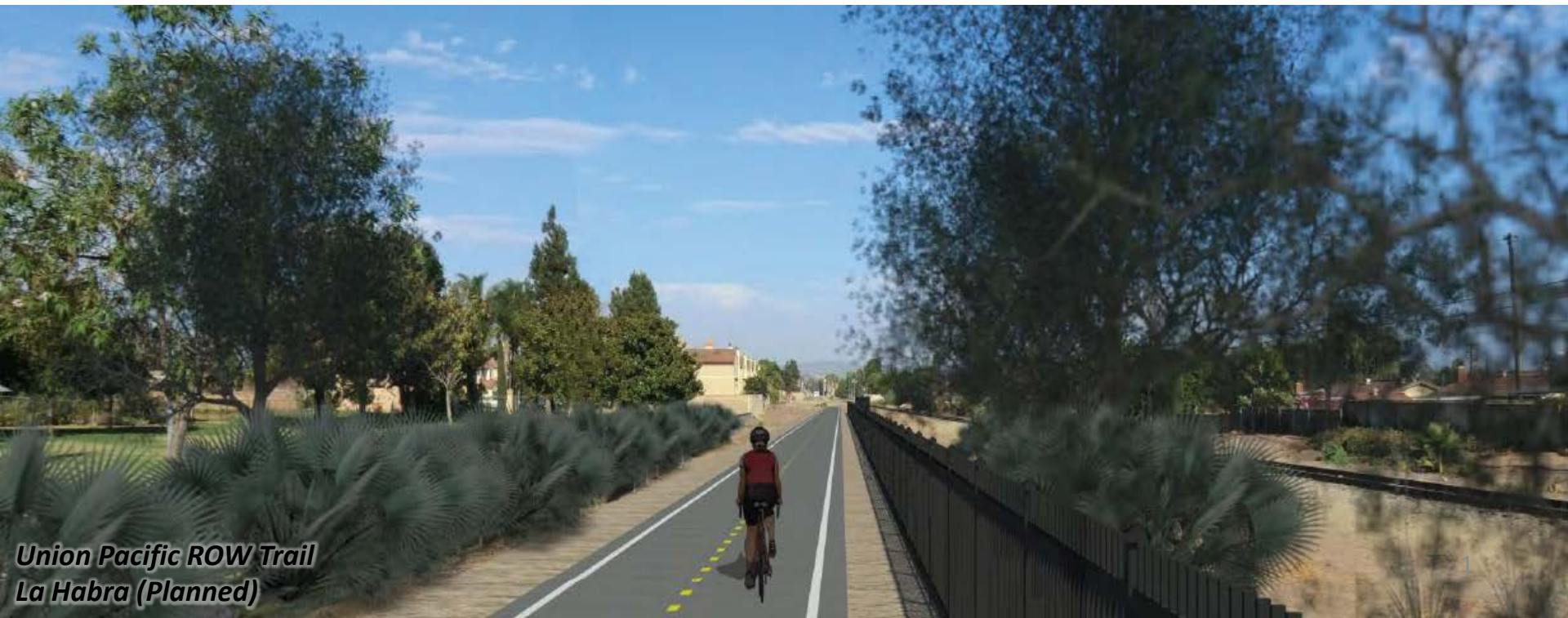
Union Pacific ROW Trail La Habra (Planned)