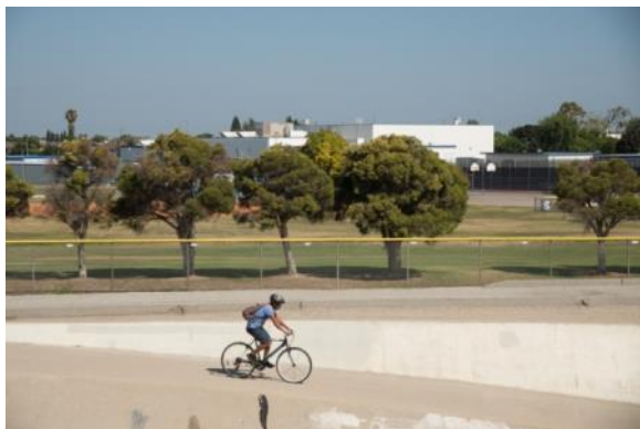
Los Alamitos High School Coyote Creek Trail