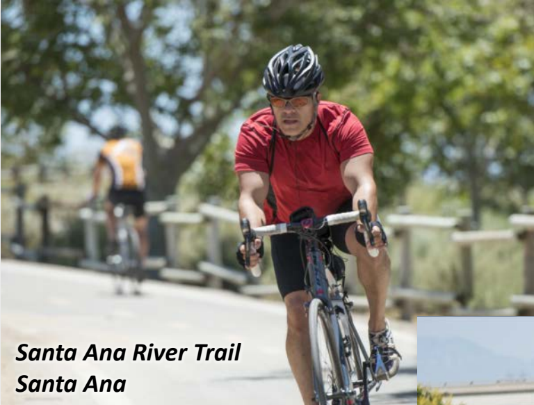
Santa Ana River Trail Santa Ana