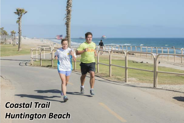
Coastal Trail Huntington Beach